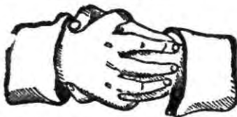
E: STRONG GRIP OF A MASTER MASON, OR LION'S PAW

F: FIVE POINTS OF FELLOWSHIP*: MAH-HAH-BONE WHISPERED IN EACH OTHER'S EAR