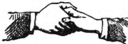
C: PASS GRIP OF FELLOW CRAFT, OR: SHIBBOLETH