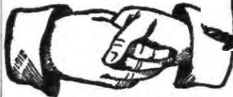
D: PASS GRIP OF A MASTER MASON, OR TUBAL CAIN [TWO-BALL CANE: INSET]