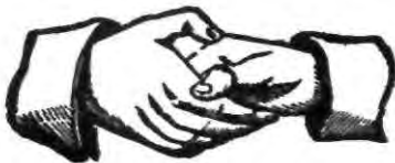
A: GRIP OF THE ENTERED APPRENTICE